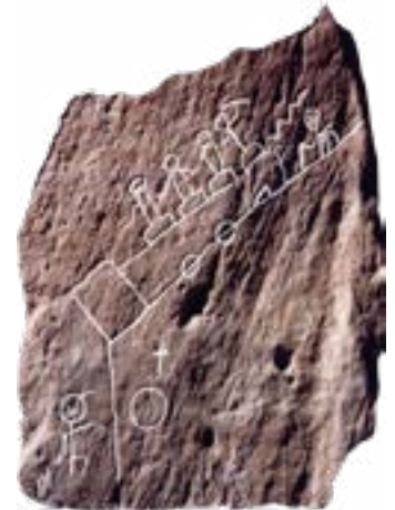
Prophecy Rock, Kykotsmovi